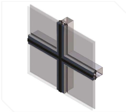
FSX 100 SSG Curtain Wall System