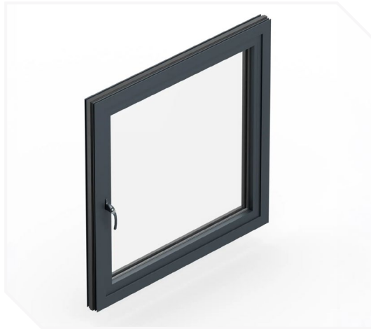
WSX 720 Reflex Open Out Casement Window