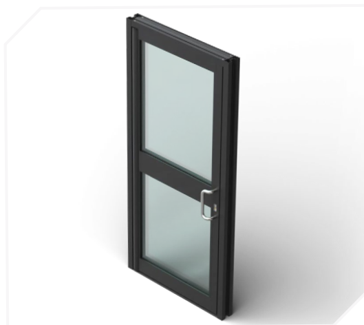
DSX 190 TB Door